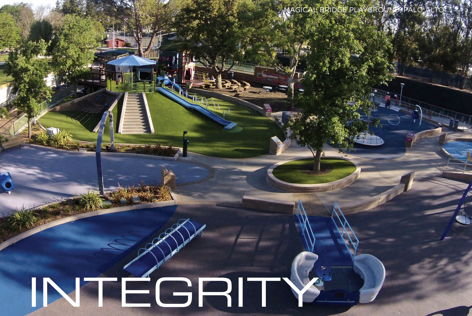
MAGICAL BRIDGE PLAYGROUND, PALO ALTO